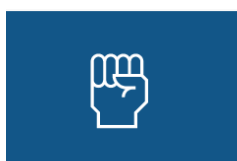
Reducing stress and building resilience