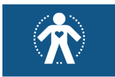
Body confidence and self esteem