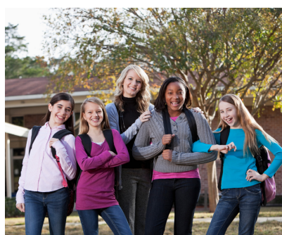
The peer led approach can help create a healthy positive culture for the whole school